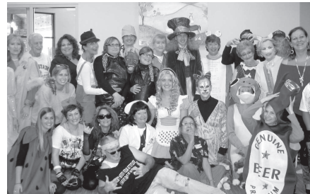
Staff and volunteers revealed their best costumes at the annual Halloween party.